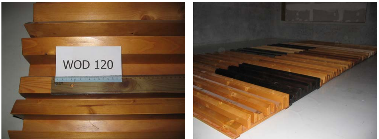
Fig. 1 and 2 – Sample (with sobreposition of a 40 cm ruler) and test assembly on the reverberant chamber floor.

The measured sample was tested on March 4, 2005 using panels of various dimensions (120x60 cm e 60x60 cm). The sample, with a total area of 13.12 m 2 , was placed on the floor of the reverberation room (see Fig 1 and 2).